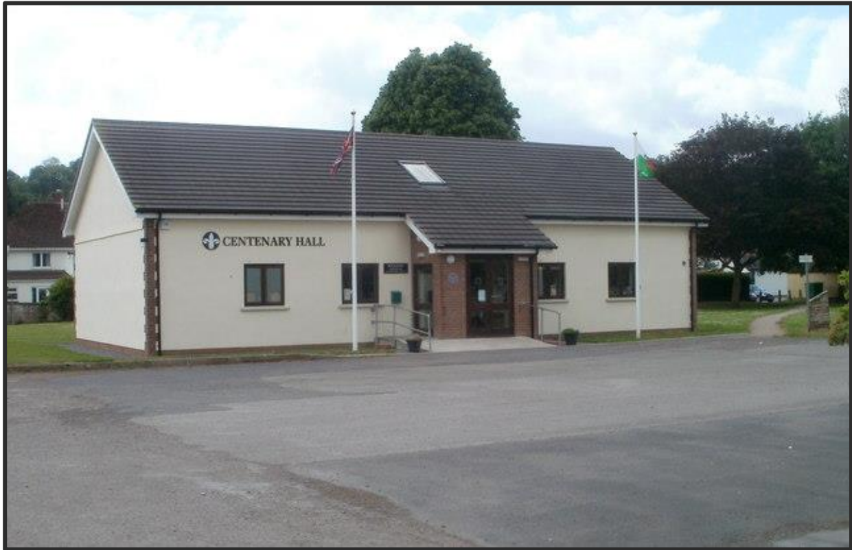
Usk Centenary Hall, Maryport Street, NP15 1AD

To the riders and their families attending our final time trial event of 2024, thank you for your support and we hope you enjoy your time with us on Sunday. Our headquarters for the event is at Usk Centenary Hall (also known as Usk Scout Hall), which is little more than a mile from the start line for the R25/7 course.