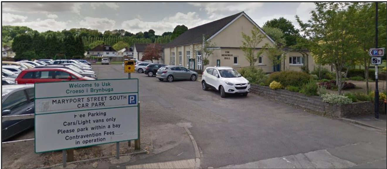
Usk Memorial Hall, Maryport Street, NP15 1AD

To the riders and their families attending our final time trial event of 2023, thank you for your support and we hope you enjoy your time with us on Sunday. Our headquarters for the event is at Usk Memorial Hall , which is little more than a mile from the start line for the R25/7 course.