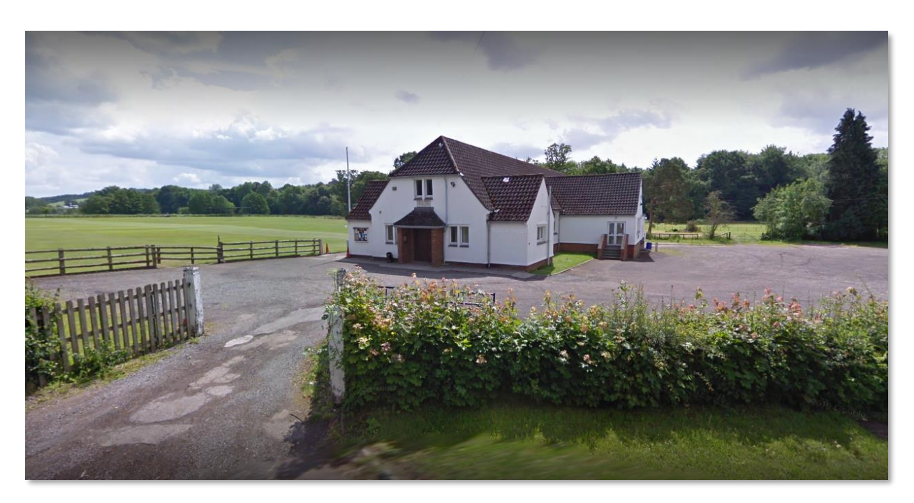
Llanarth Village Hall, Groesonen Road, NP15 2AU

Our base for the day is Llanarth Village Hall, which offers ample parking and is approximately 4½ miles from the start line. Digital readers can click or tap <u>here</u> to view the route to the start.